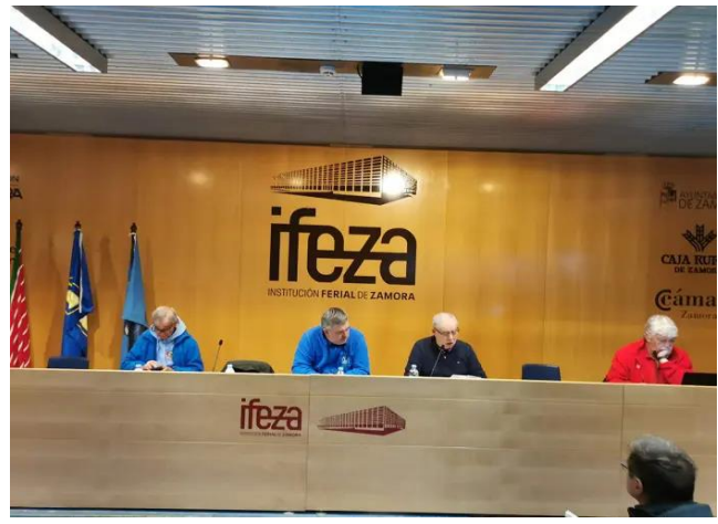
FECC Extraordinary General Assembly 2024