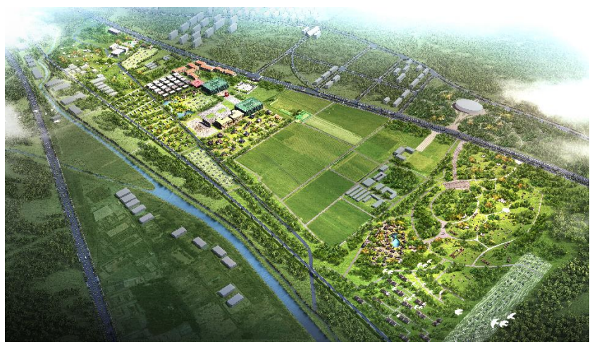
RV World Camping Park

The campsite has racing tracks, rock climbing, indoor and outdoor swimming pools, fitness equipment and other facilities. Camping will be a relaxed experience.