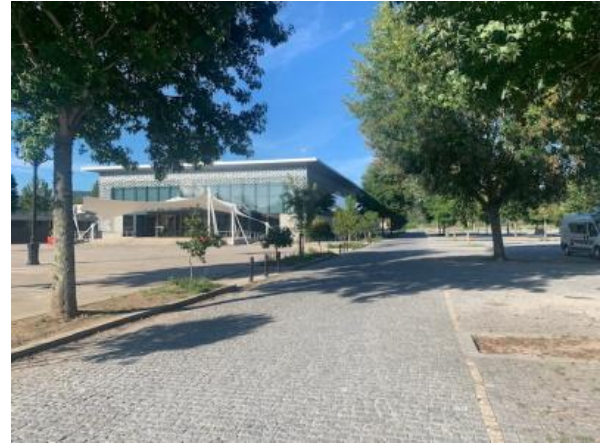
The free car park near the city centre is at your disposal