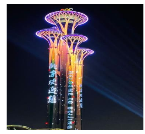
The Olympia Stadium in Beijing by night Definitely worth seeing!