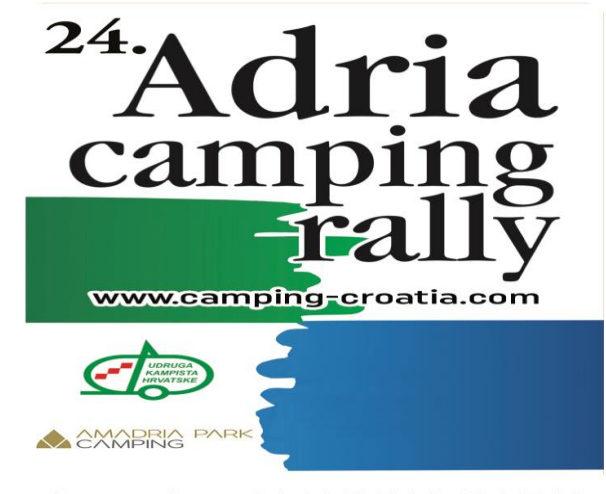
Camping AMADRIA PARK Šibenik, 23.–30. lipnja 2024.