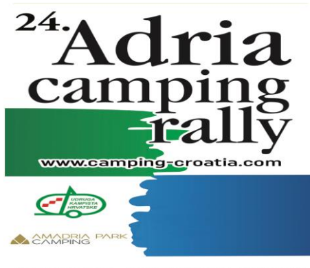
Camping AMADRIA PARK Šibenik, 23.-30. lipnja 2024.

Further information on ukh@camping-croatia.com