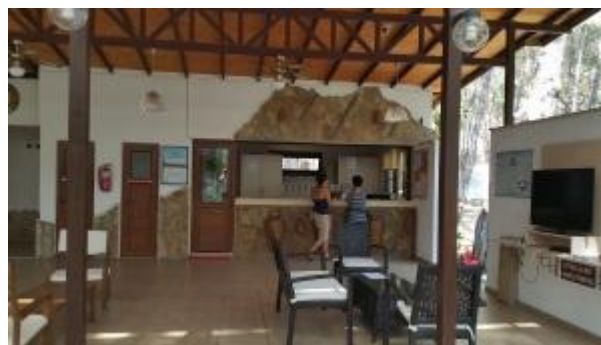
Camping Aktur – Datça